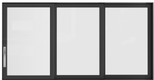
Silo render $30