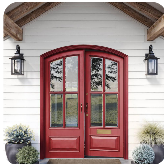
All options and colors $30 per option