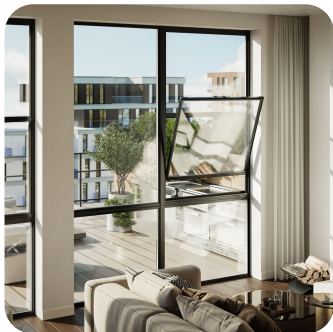
Lifestyle render $300